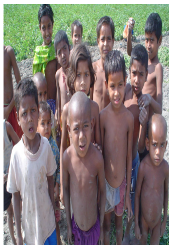
Before DCI Support