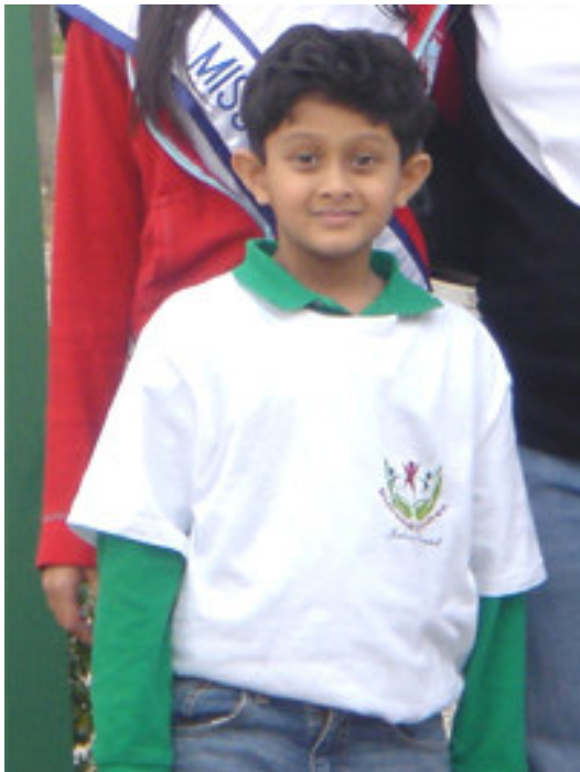
US Sponsoring Child

One of the goals of DCI is to educate American children about world hunger and poverty. Through the Sun Child Sponsorship program, American children have a unique opportunity to develop friendships with children in Bangladesh. Our hope is that these exchanges will promote cross-cultural understanding. We also believe that these children are more likely to become empathetic leaders in the future.