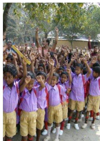
After DCI Support DCI Sponsored Child