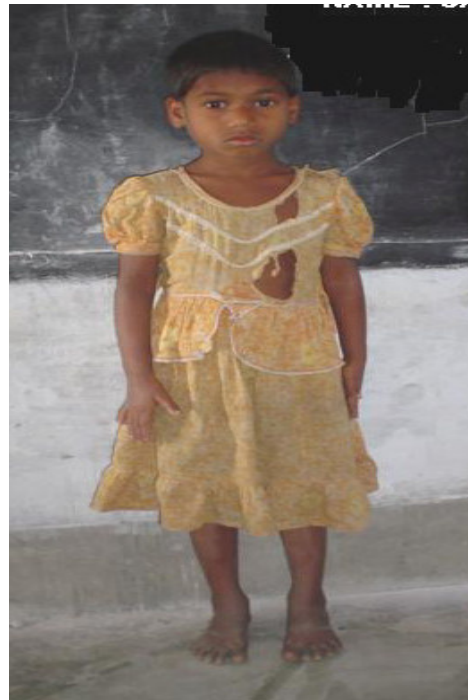
Sponsored Child in Bangladesh